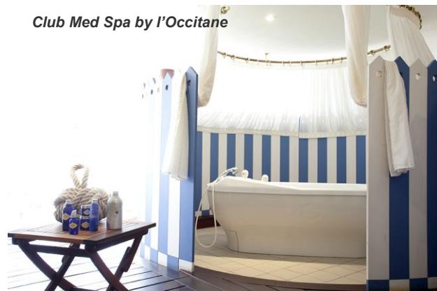
Club Med Spa by l'Occitane